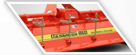
4 RAM SPRINGS TO ADJUST THE TRAILING BOARD