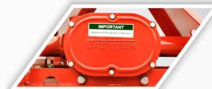
HEAVY DUTY GEAR BOX