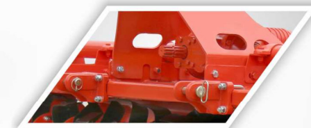
HIGH TENSILE NUT & BOLTS