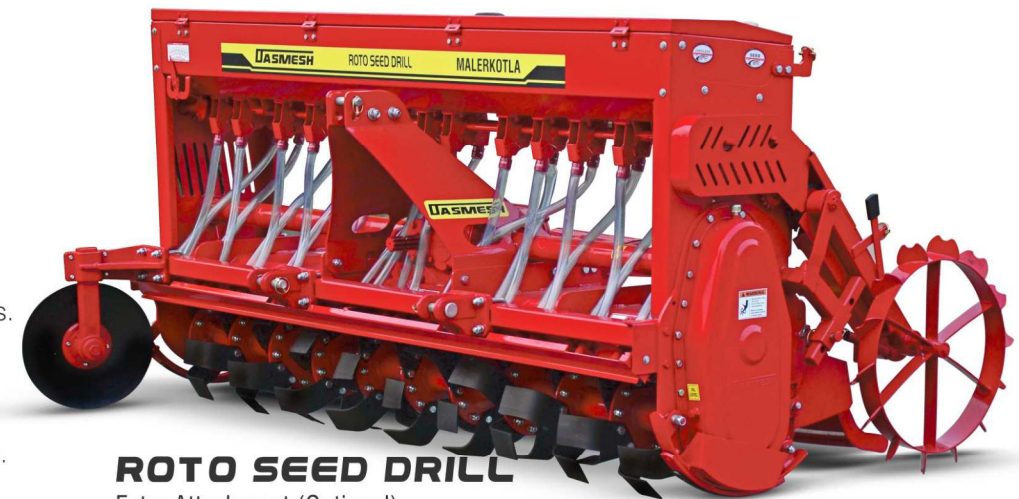
ROTO SEED DRILL Extra Attachment (Optional)

Note : As our policy of continuous development, specifications and performance can be changed without any prior notice.